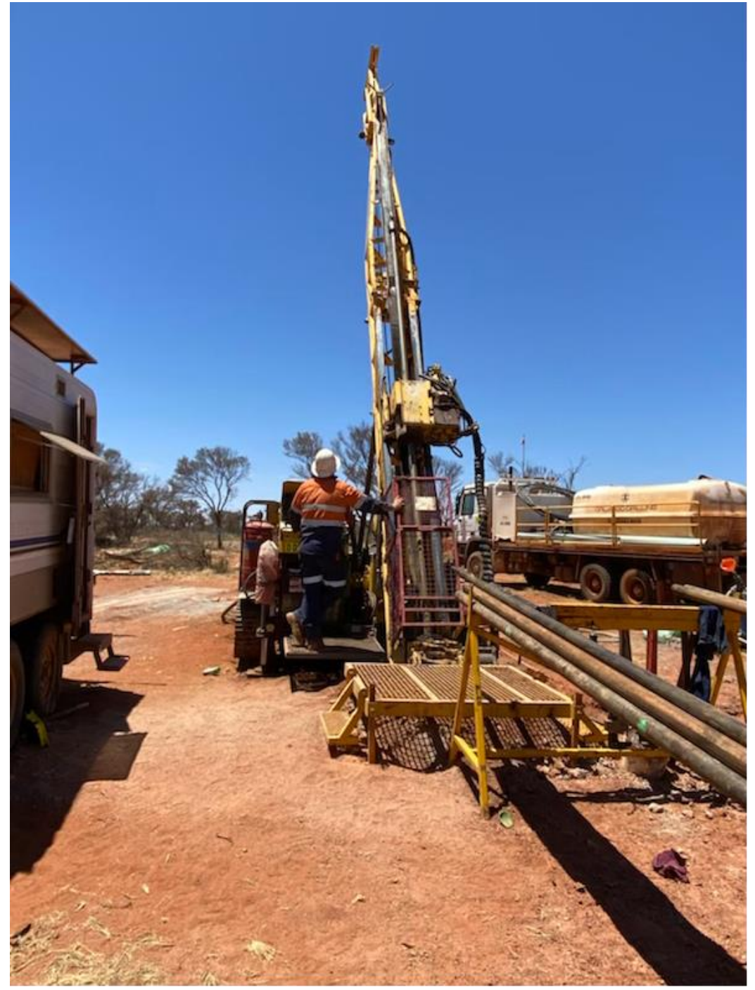
Figure 1 –Diamond Drill Rig operating at Abercromby Gold Project, Wiluna, WA

The diamond drilling program comprises 2,000m across nine holes (refer Figure 2 below).