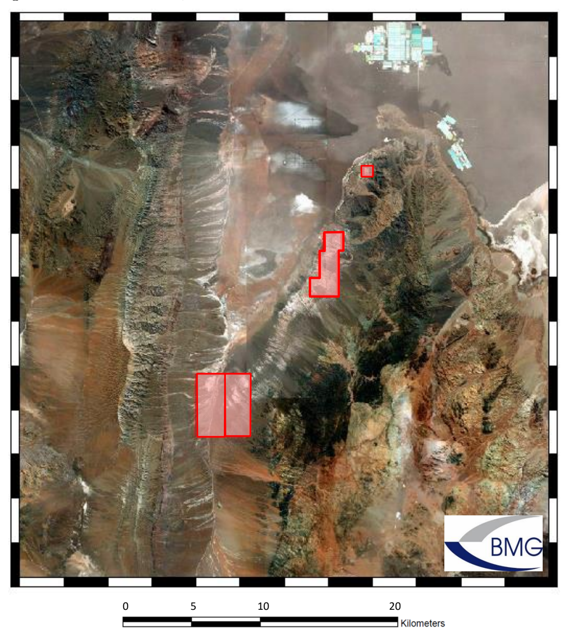
Figure 2 – Salar de Atacama, Salar West claims

BMG proposes to immediately undertake geophysics in the Salar West central and southern areas as part of its due diligence process, to define the aquifer target zones for the initial drilling program.