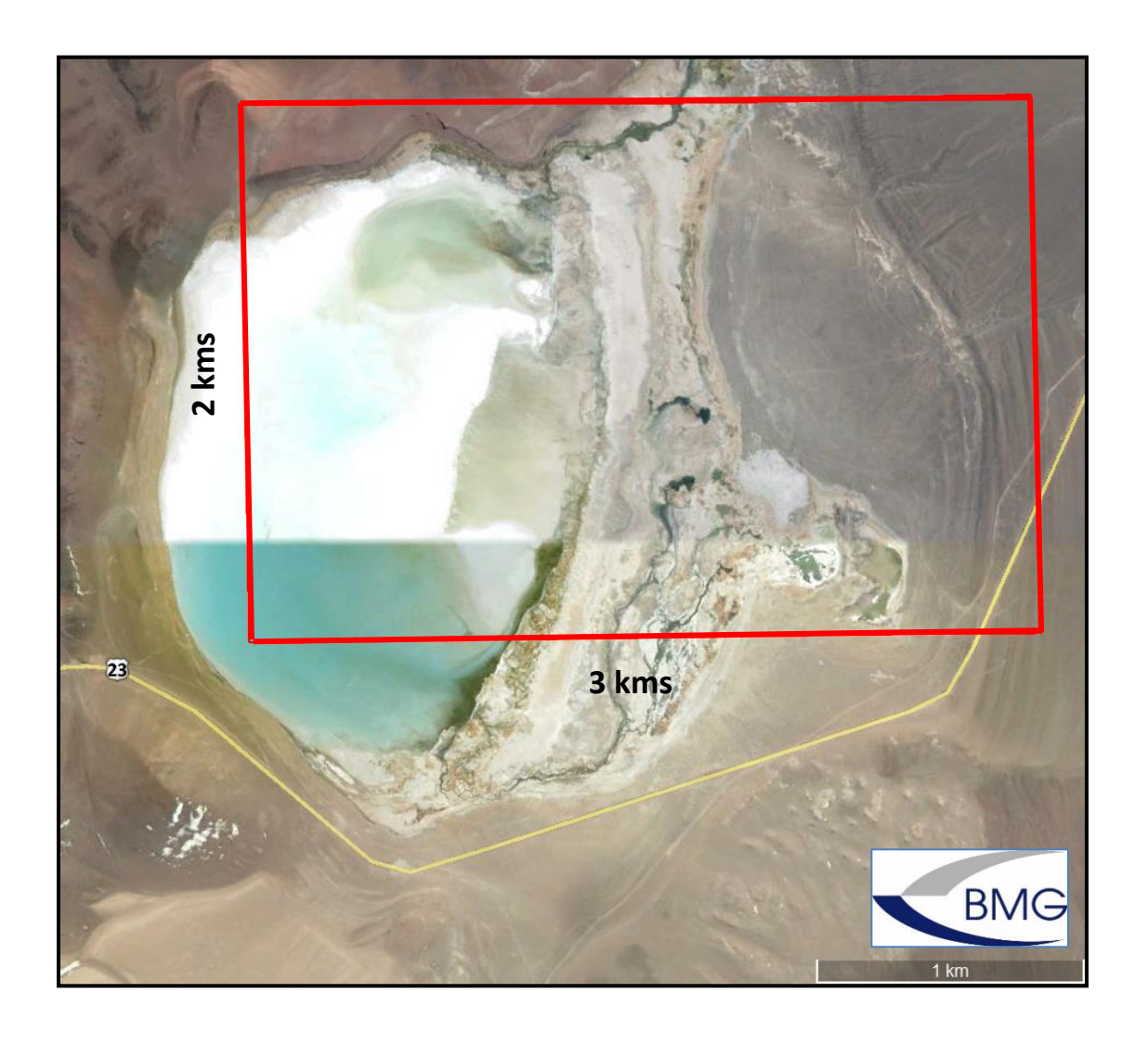
Figure 4 – Salar de Tuyajto – Natalie claim area

Initial brine samples are currently being analysed for the potential to host a high grade Li brine deposit. The next phase of work will involve geophysics to delineate the target aquifer depth and size, with a subsequent confirmatory drilling program.